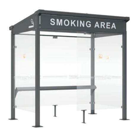
Code 529405 +529407+529408 +209147+529401 (screen print not included)