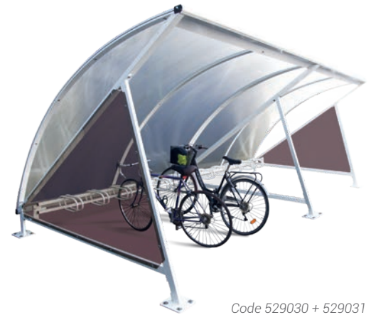
Code 529030 + 529031