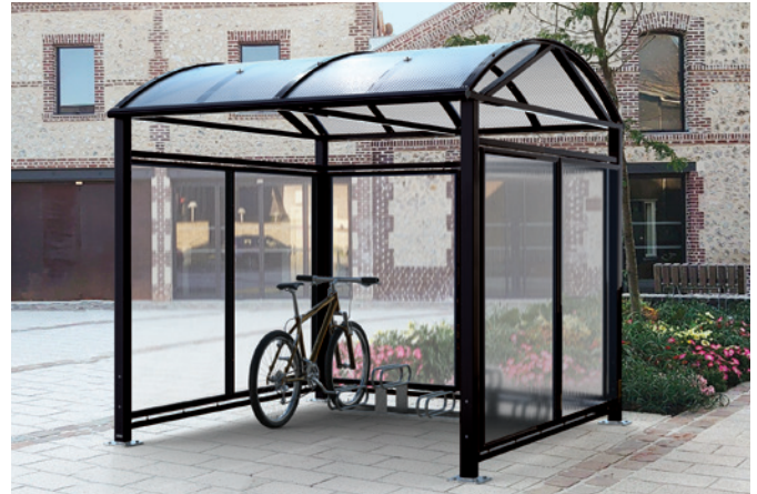
Code 529082 + 204719