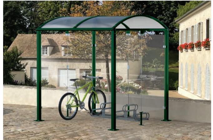
Code 529022 + 204719