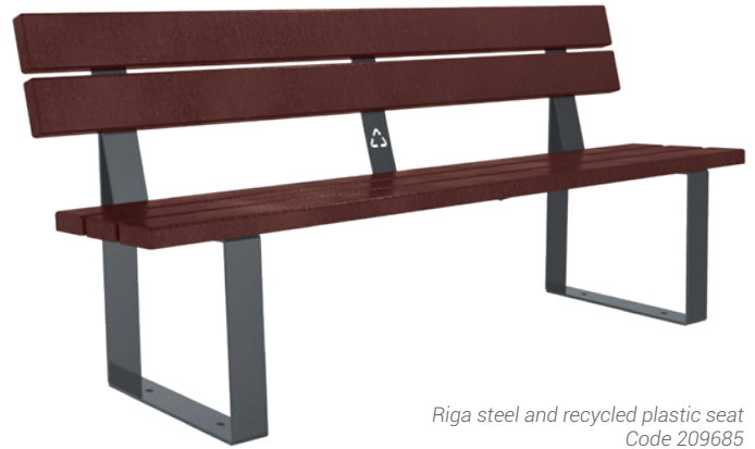
Riga steel and recycled plastic seat Code 209685