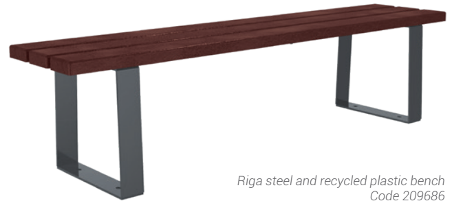
Riga steel and recycled plastic bench Code 209686