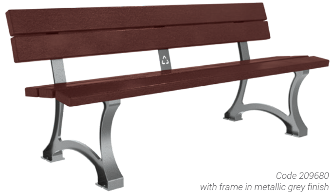
Code 209680 with frame in metallic grey finish