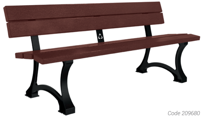
Code 209680 with frame in black finish