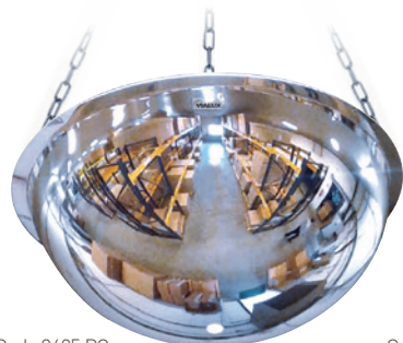
Code 3695 PC