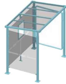
With one "2000" display case and one side cladding