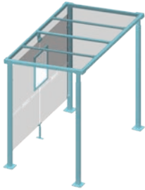
with no side cladding

> All of our models are supplied with rear cladding and timetable display case