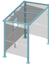
With two side claddings