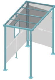
With one side cladding