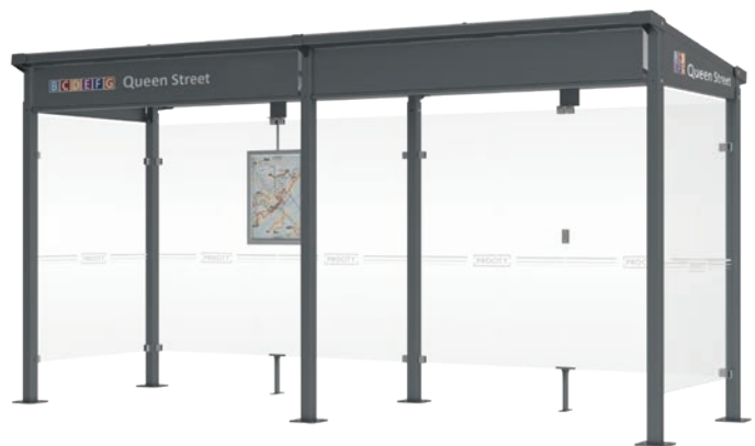
Code 529243 + 529407 + 529409