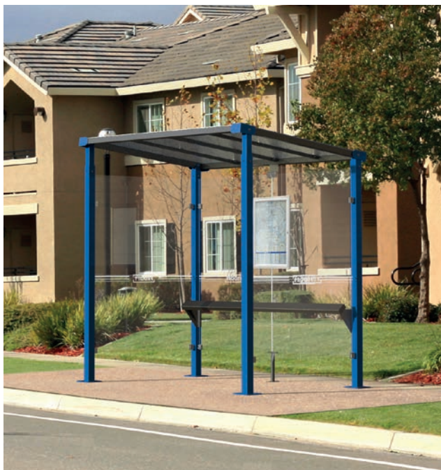
Code 529242 + 209147