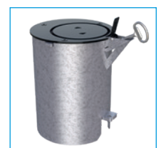
Lockable socket for removable bollards