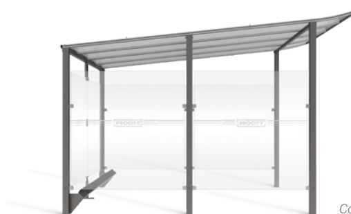
Code 529190 + 209147