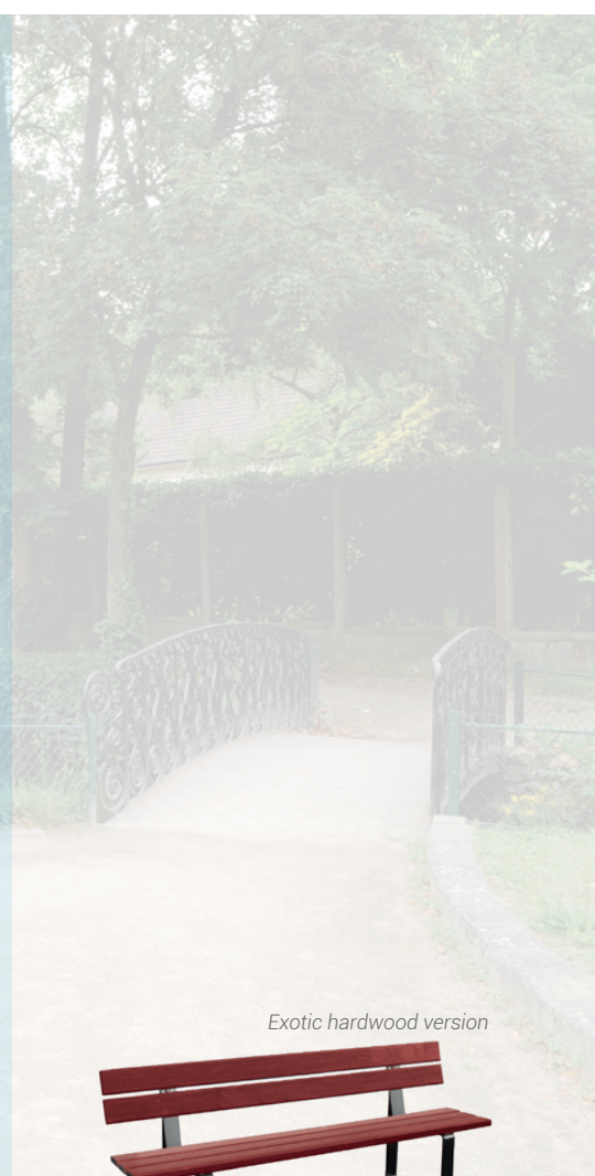
Exotic hardwood version