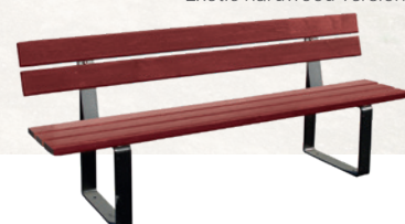
Untreated exotic hardwood version