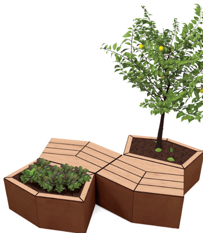
Code 2 x 209670 + 2 x 209671