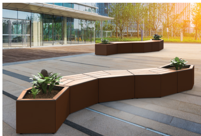
Code 209670 + 209671