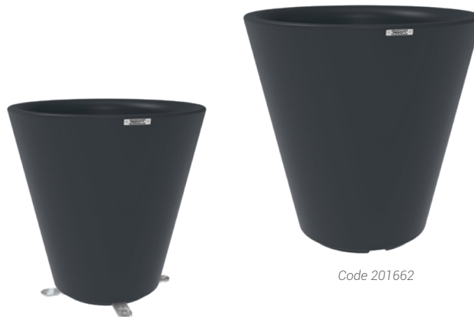
Code 201661 + 201669